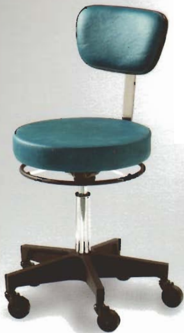
Pneumatic examination stool Model 5346