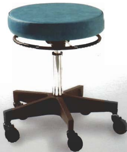
Pneumatic examination stool Model 5340