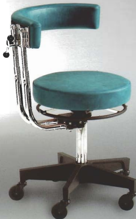
Pneumatic examination stool Model 5356