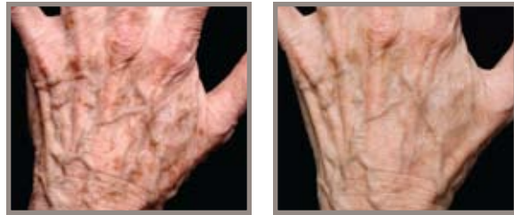
BEFORE THERMAGE/IPL 4 MONTHS POST TREATMENT Single treatment by Flor Mayoral, M.D.

Thermage can also be used with many other aesthetic procedures. Combining IPL and Thermage is a great way to help restore firmer and smoother hands and eliminate unsightly age spots.