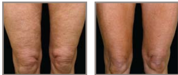
BEFORE THERMAGE 12 MONTHS POST TREATMENT Single treatment by Suzanne Kilmer, M.D.