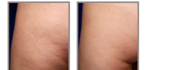
BEFORE THERMAGE 6 MONTHS POST TREATMENT Single treatment by Julio Barba, M.D.

“ All the sit-ups in the world can't tighten loose skin, but Thermage can. ” Personal Trainer, Everett, WA