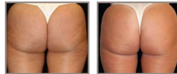
BEFORE THERMAGE 3 MONTHS POST TREATMENT Single treatment by Gregory Nikolaidis, M.D.